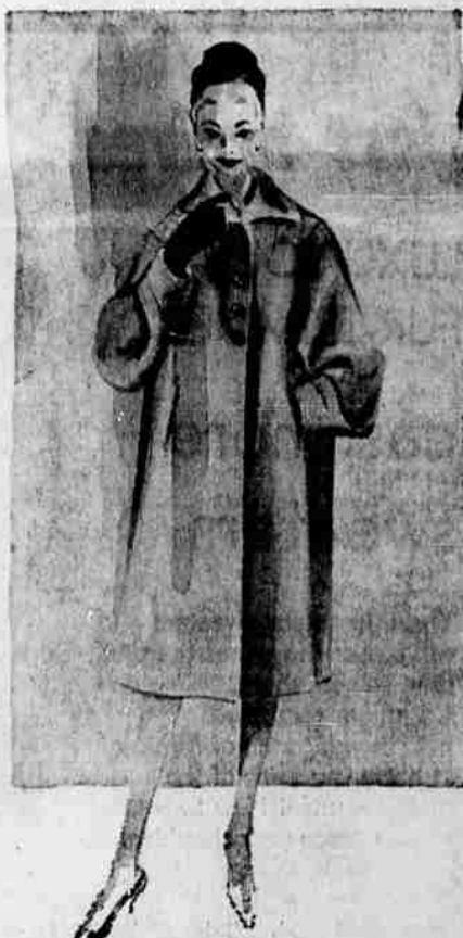
Style 444, conventional full silhouette, sleeve detail, 75.00