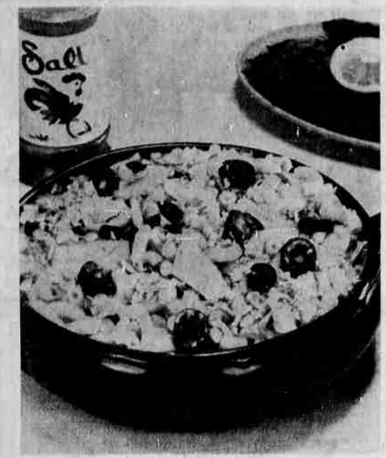
CHICKEN CASSEROLE — Chicken and macaroni are sauced with rich cheese soup, garnished with ripe olives and topped with golden cracker crumbs to make a dish with a hint of asparagus spears with fresh lemon and butter make an ideal accompaniment.