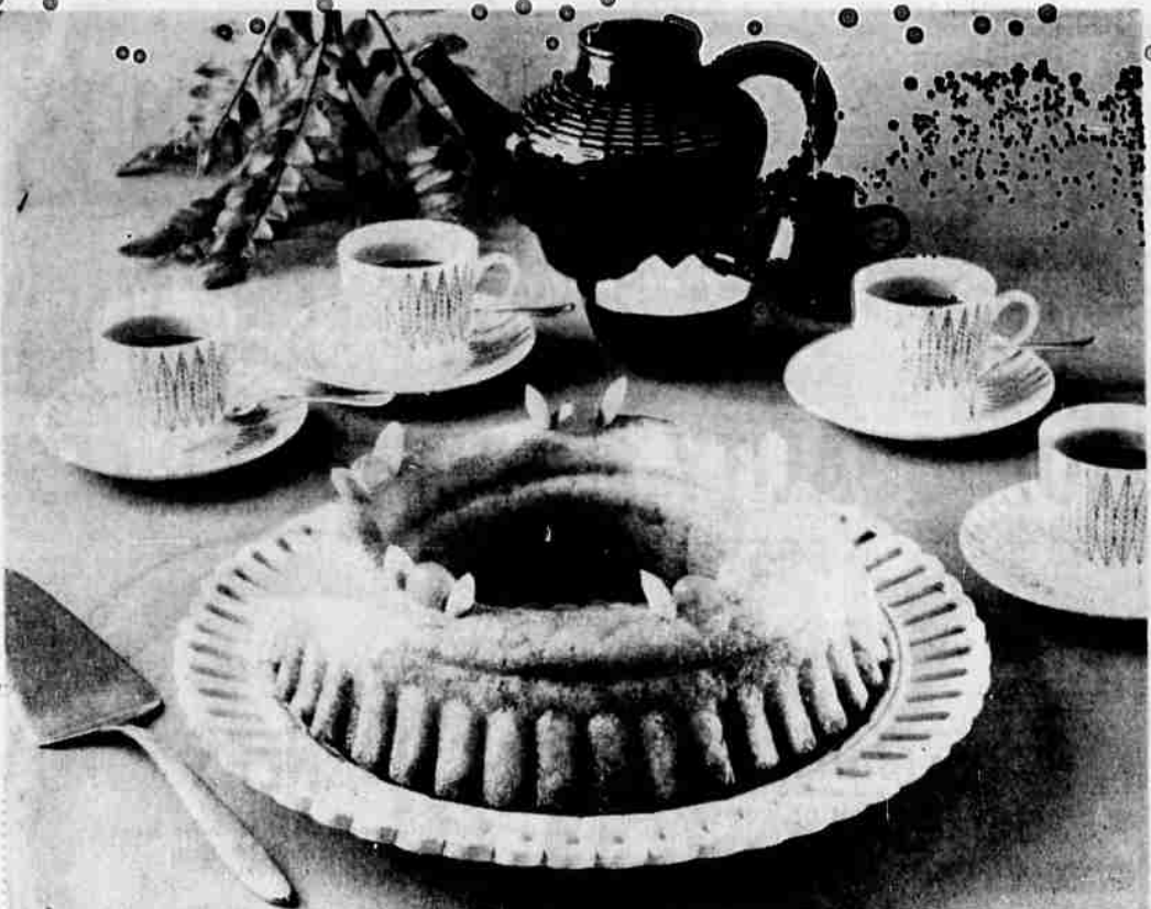
DESSERT AND TEA: This tender, yeast-raised baba is drenched with a delectable tea-based sauce that combines the flavor of rum, orange and lemon. Serve the in-

stant tea with a touch of ceremony in tiny cups with the choice of a dash of rum or sugar cubes flavored with orange rind.