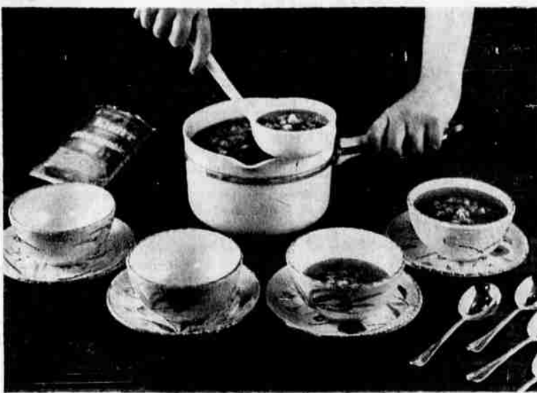
HOT AND GOOD — For a hearty luncheon or dinner soup, Italy has sent this country a dehydrated vegetable soup with the most delicious seasoning. It is one of seven new varieties developed by the same company, one you know, just now coming to Klamath Falls markets. These seven soups, reminiscent of seven countries, are different.