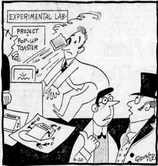
"He'll be the third to collect workmen's accident compensation this week!"