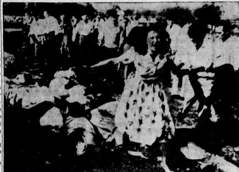
DEATH AT TRACK — A frantic woman runs from the death scene after a racing car killed 11 spectators at Monza, Italy, auto track. Ace driver Wolfgang von Trips also died in the accident.

Magistrate I. M. Eweans called it "an act of stupid boogalomanism toward a high-ranking guest."