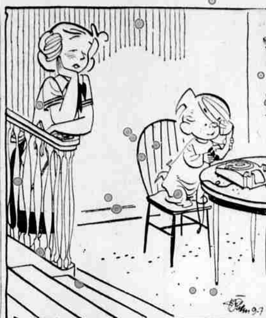
AN DON'T FORGET WHAT COWBOY BOB SAYS: IF YA GOTTA COUNT SOMETHIN', COUNT CATTLE. SHEEP RUIN THE GRASS!*