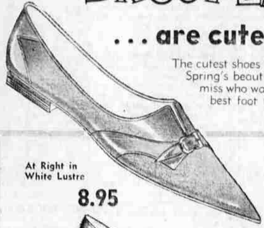
At Right in White Lustre

The cutest shoes in town! Spring's beauties for the miss who wants to put her best foot forward.