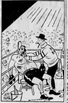
"Thank heavens he finally closed both of my eyes... I'd hate to see myself after this fight!"