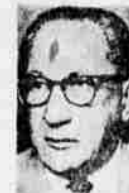
THE DOCTOR SAYS . . .

The task of winning international acceptance will be taken up by the U.N. in April.