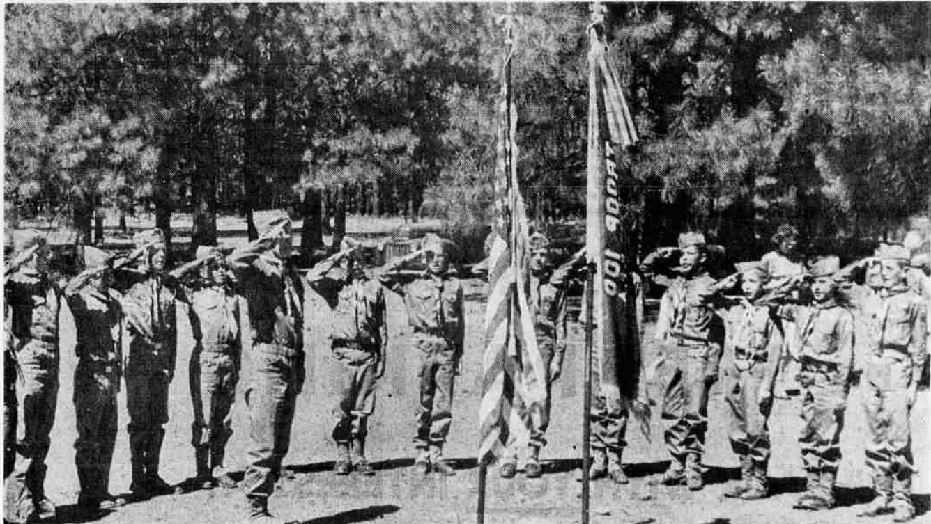
DEVOTION TO THEIR COUNTRY is one of the first virtues a Boy Scout learns. These boys are members of Troop 100, sponsored by Peterson School Parent and Patron Association.