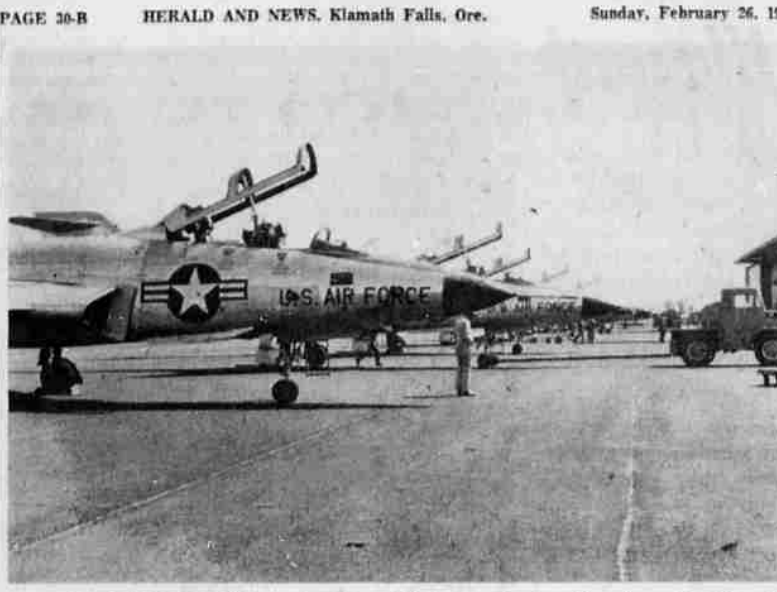
THE F101-B "VOODOO" is a familiar sight by now in the skies above the Klamath Basin. The powerful aircraft is a twin-engine, supersonic jet interceptor capable of firing the "Genie" air-to-air atomic rocket. The "Voodoo", equipped with a radar-controlled armament system, carries a crew of two—the pilot and radar intercept officer. The 101's at Kingsley are manned by aircrews of the 322nd Fighter-Interceptor Squadron, commanded by Lt. Col. Carl H. Leo.