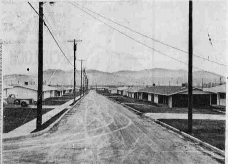
A CITY WITHIN A CITY is an apt description of Falcon Heights, the Kingsley Field housing area completed in November 1958 at a cost of 4 1/2 million dollars. The development has 145 modern duplex units to house 290 Air Force families. Many more families make their homes in Klamath Falls and the surrounding area due to a long waiting list for Falcon Heights. The development, built under the Capehart Housing Bill, is regarded as one of the most modern in the Air Force.