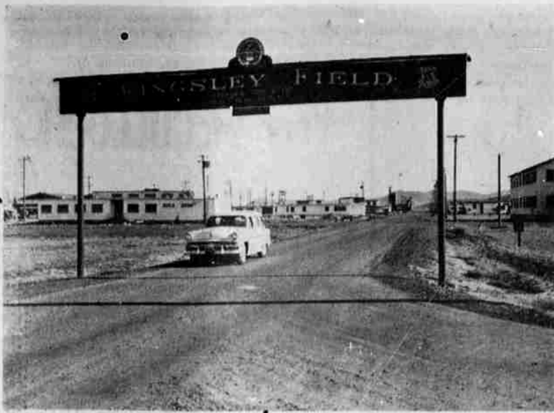
KINGSLEY FIELD , located five miles southwest of Klamath Falls, makes a tremendous contribution to the economy of the area. The base has a population of 1,500 and an annual payroll in excess of six million dollars. In addition, another two million dollars per year are spent with Klamath Basin business firms for a series of far reaching projects. The base, one of the newest In Air Defense Command, is headquarters for the 408th Fighter Group, which has earned an enviable reputation in scarcely more than a year in "operational" status.