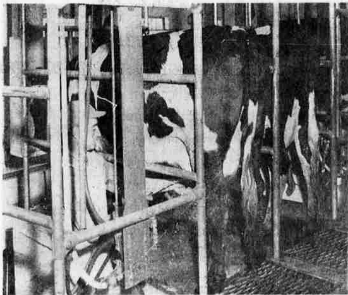
Modern Milking Parlors

Three Big Progressive Steps Made By Every Member of the Klamath Basin Grade A Milk Producers Association That Mean Better, Fresher Milk for You!