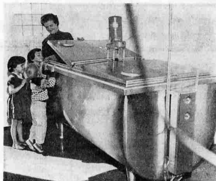
Refrigerated Milk Coolers

Gone are the milk stools and milk pails from our local dairy farms. In their place are spotlessly clean modern milking parlors with sparkling stainless steel milking machines and networks of stainless steel pipes that take fresh sweet milk directly from prize dairy cows to . . .