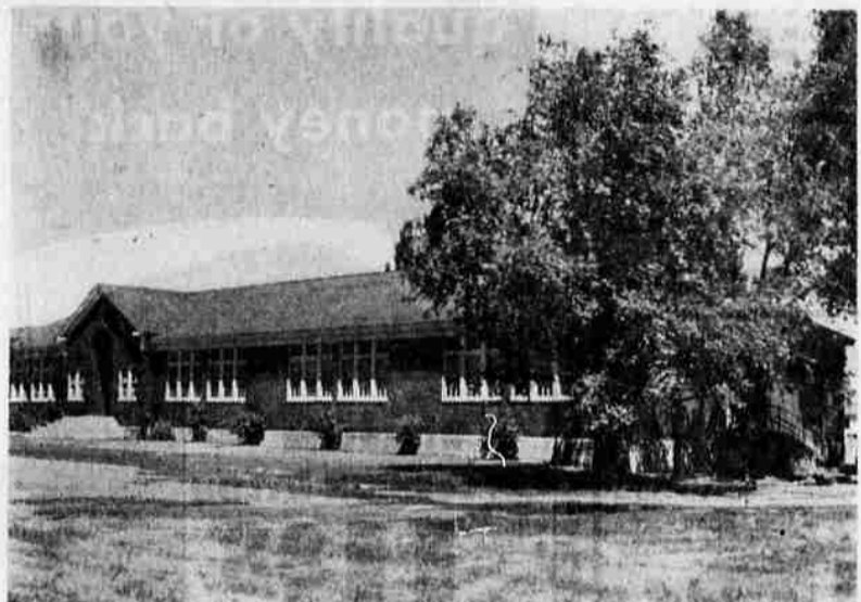
HENLEY ELEMENTARY SCHOOL has 270 students in grades one through six and 12 classrooms and 10 teachers to serve them. The two spare rooms will be filled next year. Charles Hale is principle. The school serves most of the area in the Henley High School district east of Falcon Heights.