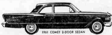
1961 COMET 2-DOOR SEDAN

We cordially invite you to stop in and get acquainted. Inspect our up-to-date facilities and equipment; meet our courteous staff which is ready to serve you. Come in and visit with us soon. Make our dealership your quality headquarters for sales and service.