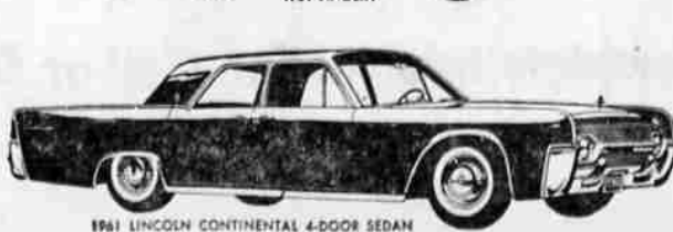
1961 LINCOLN CONTINENTAL 4-DOOR SEDAN