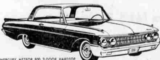
1961 MERCURY METEOR 800 2-DOOR HARDTOP