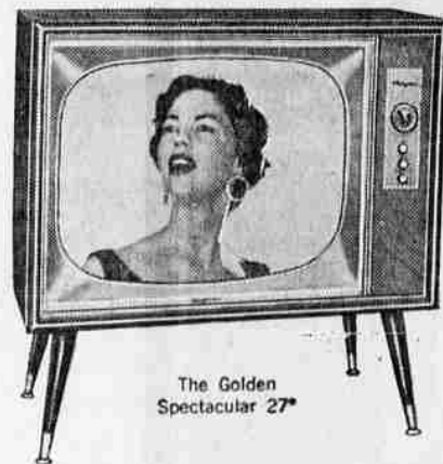
The Golden Spectacular 27*