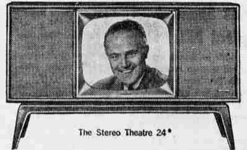
The Stereo Theatre 24*

From Magnavox, originators of the Stereo-TV, Radio Home Entertainment Centers, we offer you the famous Stereo Theatre 24... with a revolutionary new Magnavox automatic record player that eliminates record and stylus wear... your records can now last a lifetime. The "Feather-touch" Stereo Diamond Pick-up tracks at only 1/10 ounce pressure. No flutter, wow or rumble... always plays on true pitch. Big 24" chromatic TV with Magnavox Quality Gold Seal chassis... picture perfect with optical filter.