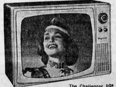
The Challenger 19*

THE BIGGEST AND CLEAREST PICTURE IN ALL TV... and only from Magnavox! 400 sq. in. optically filtered viewing area... nearly half-again as large as most 23" TVs. Convenient picture-side controls... front-projected sound from Magnavox eight inch oval speaker. Magnavox Gold Seal Chassis. Ask for a "living" demonstration... you'll be amazed at the exceptional value.