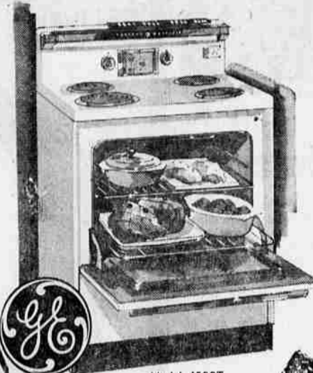
Our Biggest Seller! 30" RANGE Reg. 209.95