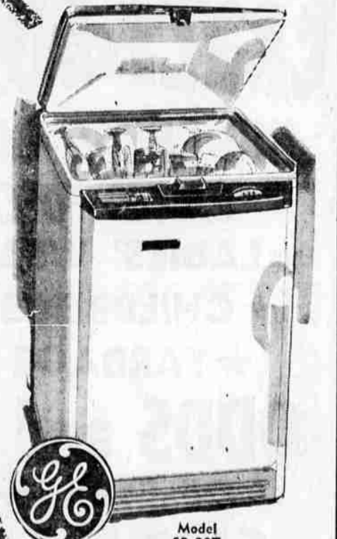
General Electric "MOBILETTE" DISHWASHER REGULAR 189.95