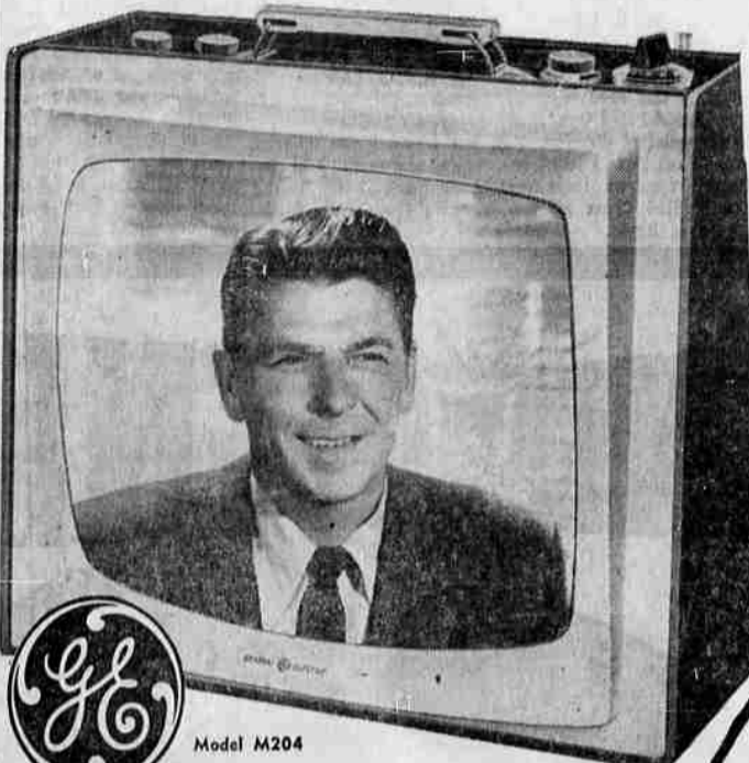
GE's Newest! The "Celebrity" 19" PORTABLE TV REGULAR 189.95

ANY ONE OF THESE APPLIANCES CAN BE PURCHASED FOR JUST $8 00 Per Month! (Your Trade-in Makes The Down Payment)