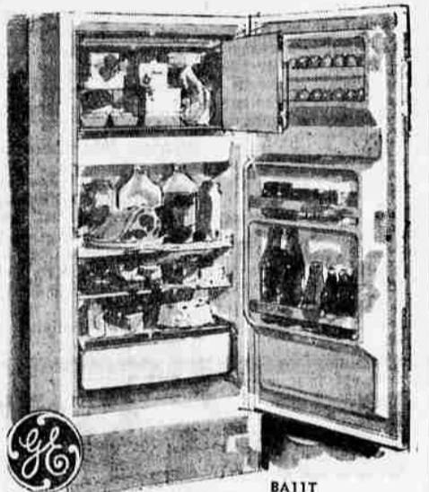
GE REFRIGERATOR Reg. 239.95