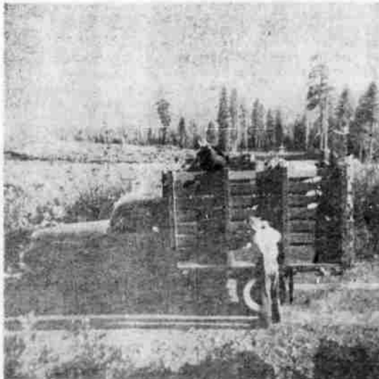
TRUCKS provide quick transportation to trails that lead to scenic spots. Most members own such trucks as well as horses.

Roughly 35 per cent of the Indian population of the United States lives in Oklahoma.