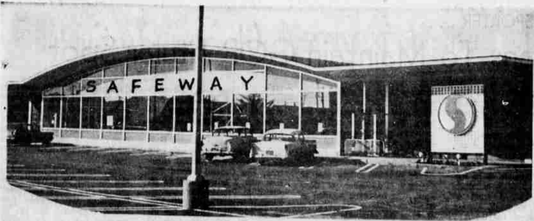
THE NEW SAFEGWAY store being proposed for construction adjacent to Ninth Street is shown here. The present structure on Eighth Street will be demolished after this building is completed, making way for additional parking space. The plan for the entire huge Safeway lot between Eighth and Ninth and Pine and High streets is shown below. Cost of the new building has been estimated at about $90,000.