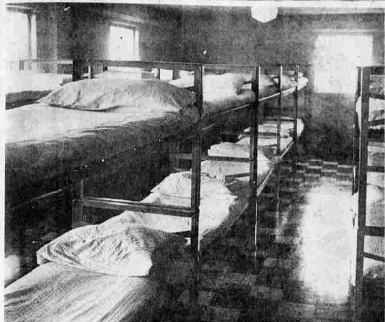
CLEAN BEDDING and pillows are provided on double deck cots for men who stay overnight at the Klamath Falls Gospel Mission. The new dormitory provides accommodations for 50. Before it was completed many men who sought shelter could not all sleep in beds.