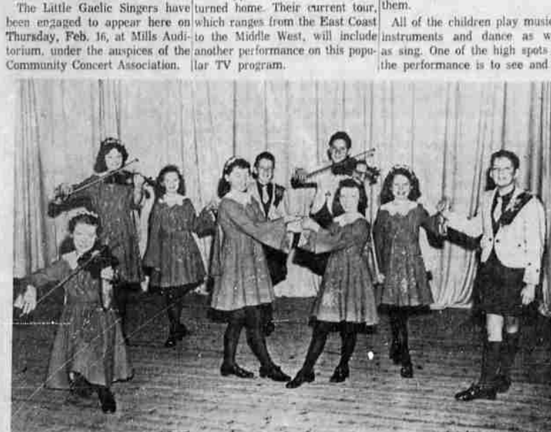
THESE LITTLE GAELIC SINGERS will be featured by the Community Concert Association at Mills School Auditorium on Thursday, Feb. 16. The group has been acclaimed across the nation for its music and songs. Twenty-one girls and three boys make up the entire group.