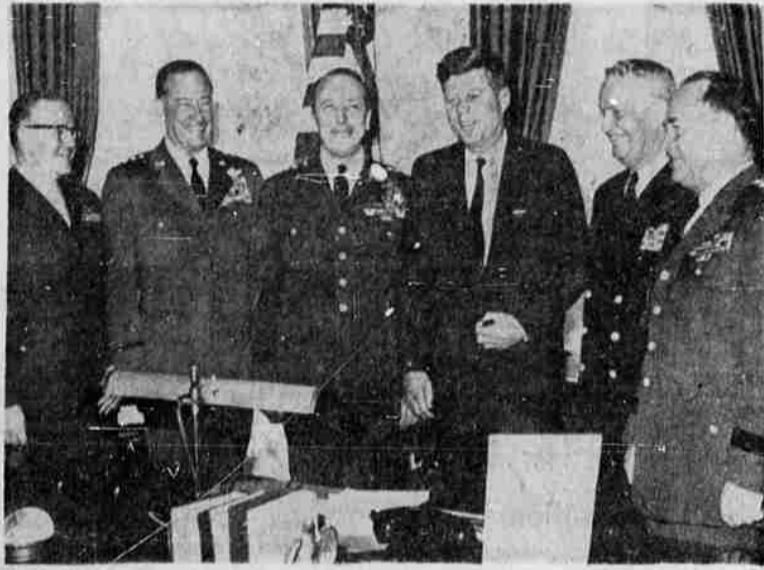
MEET CHIEFS —President John F. Kennedy poses in his office with the Joint Chiefs of Staff as they met for the first time. Left to right, are Gen. David M. Shoup, commandant, USMC; Gen. Thomas D. White, chief of staff, USAF; Gen. Lyman I. Lemnitzer, chairman of the Joint Chiefs; President Kennedy; Adm. Arleigh A. Burke, chief of Naval Operations, and Gen. G. H. Decker, Army chief of staff.