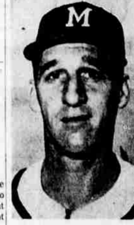
WARREN SPAHN ... 16th season