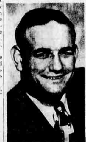
TOMMY PROTHRO ... adopts the T

offs, in the Western sector is a complex riddle. It could be Cincinnati, but not without a healthy Oscar Robertson, and it could be Detroit, with Bailey Howell and Gene Shue going well, or Los Angeles, boasting fabulous Elgin Baylor. Syracuse's Dolph Schayes had 20 points Wednesday night against the Lakers, bringing him to within 21 points of a 17,000 lifetime point total. Baylor hit 27 for the Lakers, but Jack Twyman's 21 for Cincy didn't help offset 24 and 23 by Gene Shue and Don Ohl of Detroit. The Pistons also got 21 from both George Lee and Howell. Clyde Lovellette led the Hawks with 25, but it was Len Wilkens' fourth-quarter drive that brought St. Louis the victory over New York. Willie Naulls hit 24 for the Knicks. Boston plays at Philadelphia in tonight's only NBA action.