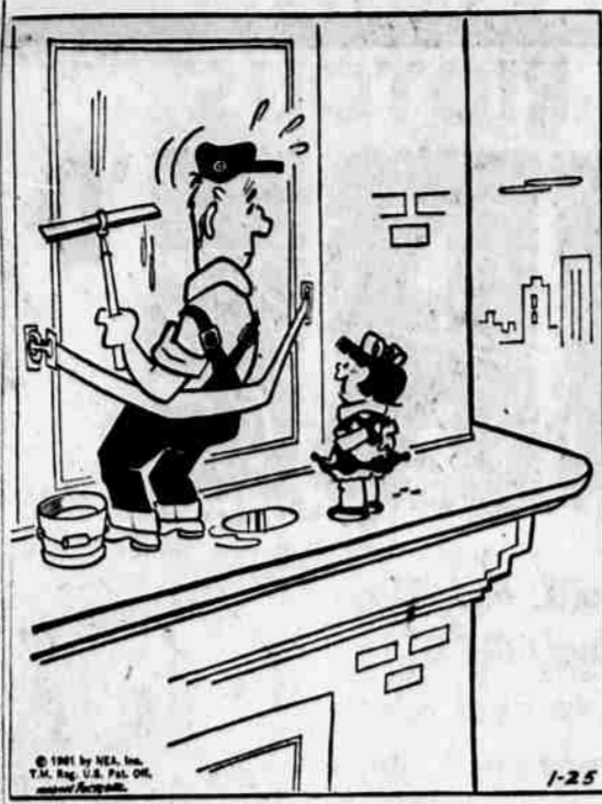
"Where's your parachute?"

Keenan served as ambassador to the Soviet Union under former President Harry S. Truman until the Soviets said he was unacceptable to them.