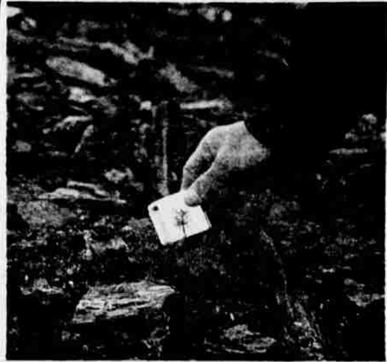
HELICOPTER SEEDING RESULT . . . this one-year-old Douglas fir seedling is outlined by International Paper forester in company's Grand Ronde Tree Farm. The young tree, seeded from the air last year, is part of new timber crop growing adjacent to tree farm area recently seeded this year by helicopter in IP's comprehensive aerial reforestation program. This winter IP seeded nearly 10,000 acres in its Oregon and Washington tree farms.