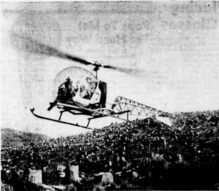
NEARLY 10,000 ACRES of International Paper Company tree farms in Oregon and Washington were recently seeded by helicopter equipped with new long-range seed-spreading device called a slinger. Note tube-like slinger underneath and in front of the 'copter, piloted by Dale Kaponen.