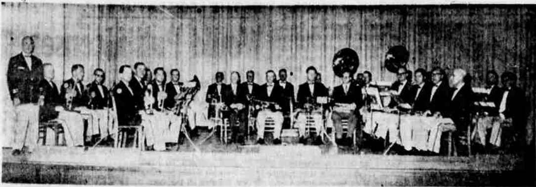
A TOP MUSICAL organization is the Elks Lodge 1247 band. This view shows the band during a recent performance at the Camp White Veterans Hospital. It was an appreciative, standing room only audience, band members report of the activity. They presented a two-part