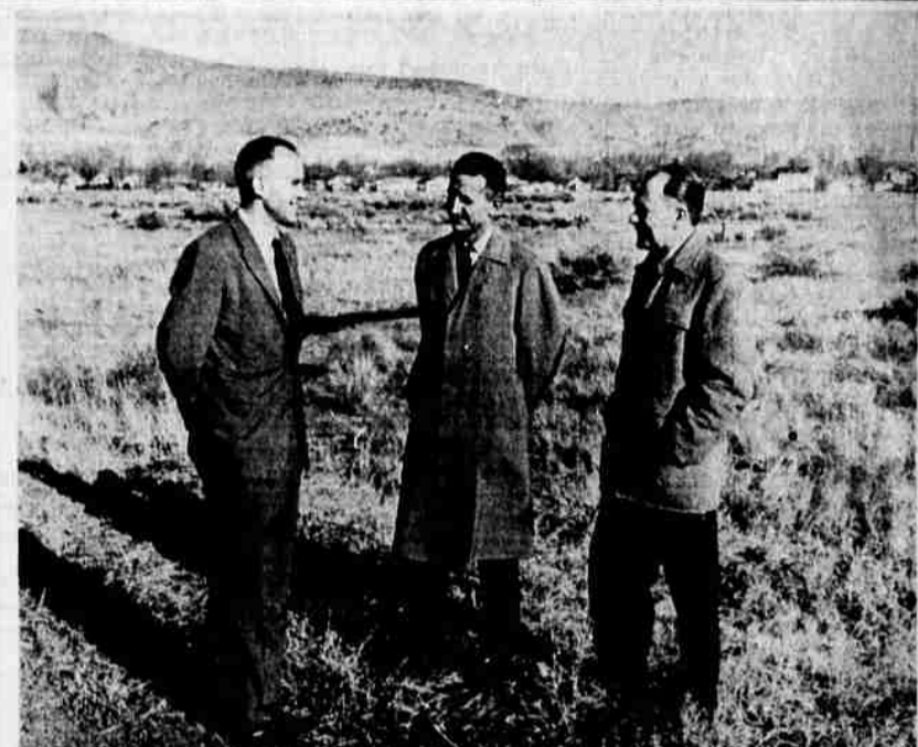
Local retailers are being given first opportunity for space in the shopping center which will have parking space for about 2,000 cars and be built in a mall-type arrangement.