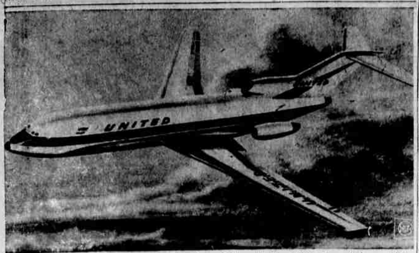
TRIPLE-TURBINE JET — Not since the days of the old Ford "Tin Goose" has a U.S. manufacturer brought out a three-engine airplane. But by 1963, Boeing Airplane Co.'s B-52, shown in artist's drawing above, is expected to be in service. Departing from usual American custom, the sleek craft's engines are mounted on the rear of the fuselage, with the third engine part of the vertical stabilizer. Carrying from 70 to 114 passengers at speeds of 550-600 m.p.h., the B-52 will provide short to medium-range service and operate out of 5,000-foot runways.