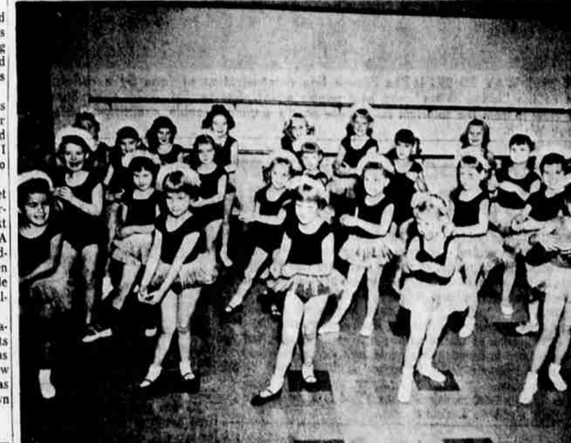
PLEASANT INTERMISSION —This group of Klamath Falls lovelies will entertain Oregon Tech basketball fans at halftime Tuesday night in the OTI gym. The young ladies are students at the Thurston School of the Dance and are to perform at the intermission of the Oregon Tech-Southern Oregon College game, the first meeting of the two for the 1961 season. Game time is 8 p.m.