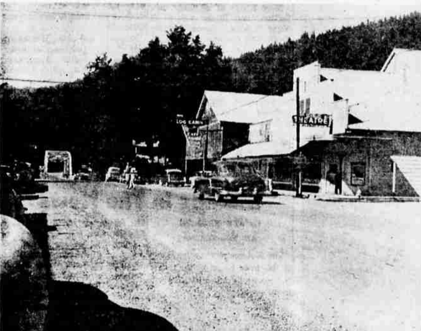
HAPPY CAMP THRIVES , even on a Sunday morning, since timber replaced gold as the community's major source of economy. A handful of residents a few years ago formed the nucleus of a town that grew to considerable size nearly overnight on the Klamath River about 60 miles west of Yreka.