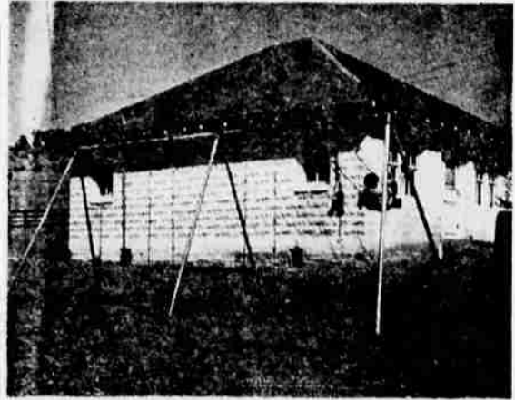
A ONE-ROOM SCHOOL near Callahan still serves children of farm families in the area.