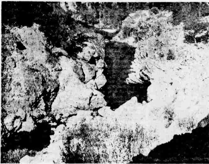
THE SALMON RIVER in a twisting canyon in the mountains of southwestern Siskiyou County flows its emerald way to the Klamath River in a series of tossing rapids and still, deep pools like these. The river gets its name from heavy salmon spawning runs in the fall.