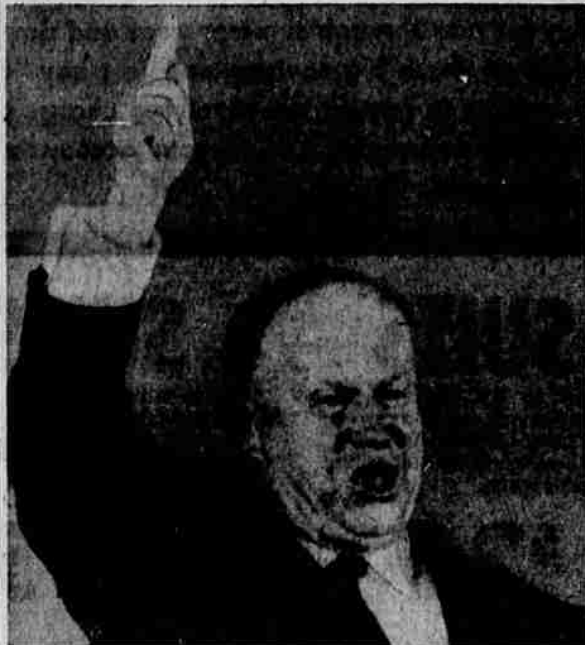
FOR IT WAS K, K, K as the Russian bully boy strode the world stage from Moscow to Paris to New York, acting his big part with a flourish. A ranting, insulting Khrushchev collapsed the Paris summit, above, in a fit of anger over the U-2. This mood dissolved into affability as he bear-hugged Cuba's brother-in-arms Castro at the New York U.N. meeting. He finished up with table-pounding act (fist and shoe).