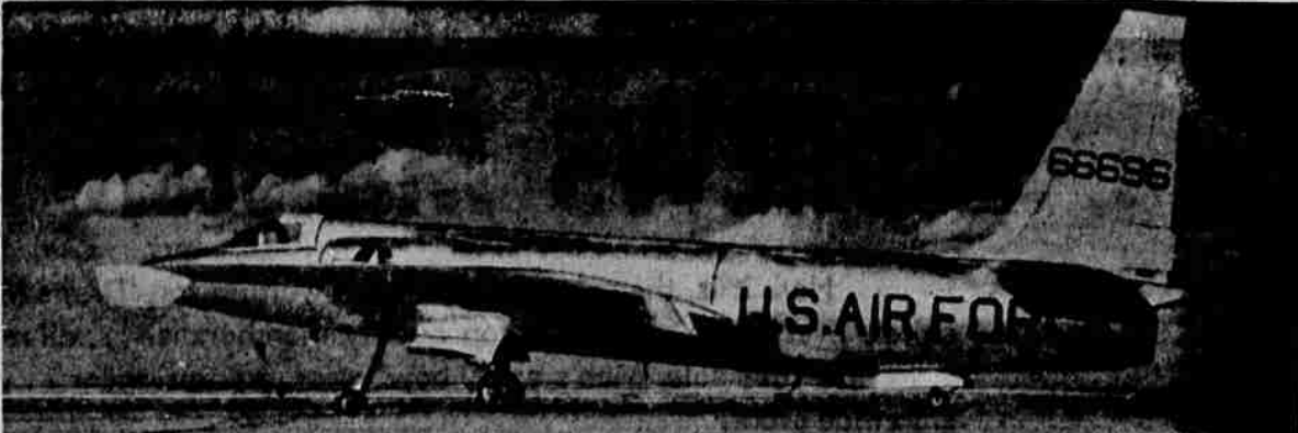
THE U-2, A TYPE OF JET-POWERED GLIDER , flew timid birdman Francis Gary Powers into the eager arms of propaganda-hungry Russia on the eve of the Paris summit. The high-flying U-2, supposedly beyond the range of Red anti-aircraft rockets, was interrupted by rocket or engine failure in its reconnaissance "overflight" at Sverdlovsk and turned up in pieces in Moscow. The plane's highly successful five-year spying program was exposed and Powers became the first man since Nathan Hale publicly acknowledged by his country as a spy. This incident and the bungled U.S. cover-up attempt were a major diplomatic defeat.