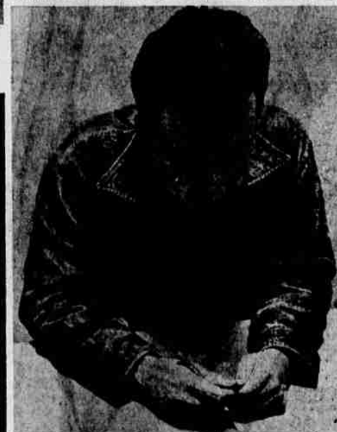
MOVEMENT TO ABOLISH capital punishment was given impetus when Caryl Whittier Chessman was executed in the gas chamber of San Quentin prison, Calif., at 10:12 a.m., May 2, 1960, 12 years after his conviction for kidnap-rape. In that 12 years, Chessman wrote four books and made scores of appeals to various courts, including 16 to the U.S. Supreme Court. After it was over a six-foot cross by U.S. Consulate in Basle, Switzerland, said: "Peace to Chessman's soul, but none to his executioners."