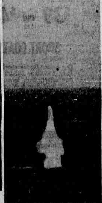
AMERICA DEVELOPED HER NEWEST and probably greatest deterrent to surprise attack, the submarine-fired Polaris, intermediate range ballistic missile. It makes the sub a moving, nearly undetectable, launching pad for the nuclear weapons. Ninety per cent of Russia's cities are vulnerable.