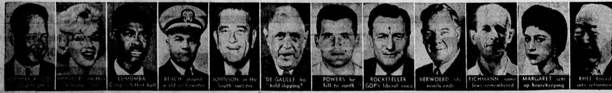
ROCKEFELLER GOP's liberal voice VERWOERD nearly ends EICHMANN some Jews remembered MARGARET sets up housekeeping RHEE forced into retirement