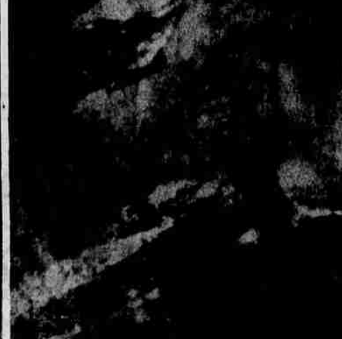
THE RED SEA, NILE RIVER and the Mediterranean Sea (top) are all shown in this remarkable photograph transmitted from space to receiving station on earth by the Tiros weather satellite. The 270-pound U.S. satellite, one of the most complex electronic packages orbited, gave an inkling of future eyes in the sky which would not only relay weather information but also be military observation stations.