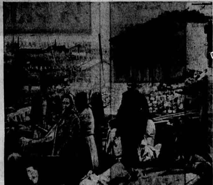
EARTHQUAKES, TIDAL WAVES, FLOODS, volcanic eruptions, disease and starvation tortured the people of Chile in a catastrophe of Biblical proportions. Five thousand persons were killed and 500,000 made homeless. Whole cities collapsed, islands vanished and volcanoes were born in the most severe quakes ever recorded. Here dazed survivors pick through the rubble of Lota looking for their possessions. Nature's assault on Chile was a powerful message that her forces are not yet subject to man. Rebuilding has only begun.