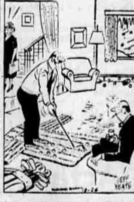
"You should buy your wife a fur coat, Ed... closest thing to the apron of a green and ideal for practicing chip shots!"