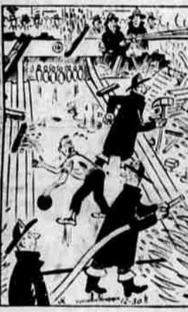
"Trust women to confuse our automatic pin spotters!"