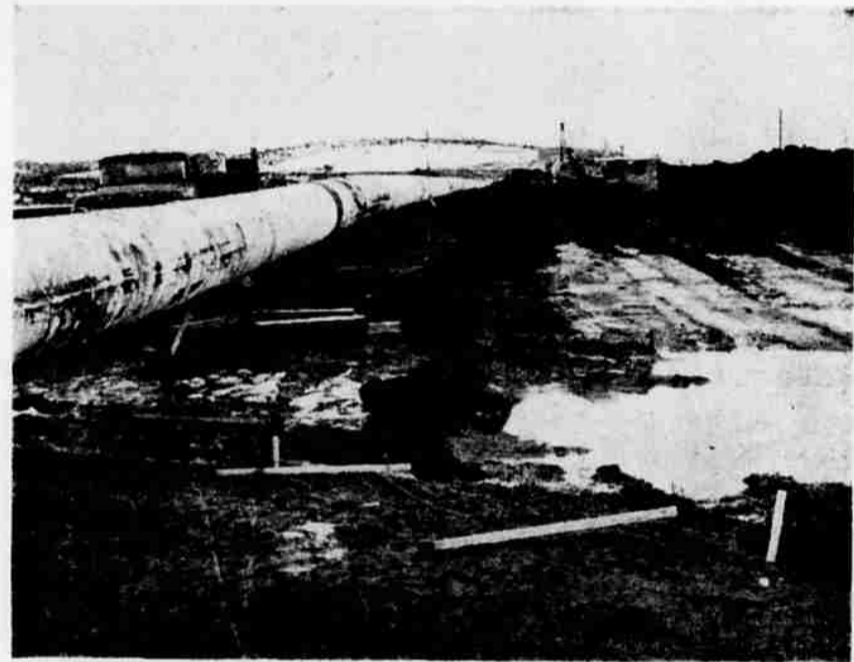
PIPELINE RIGHT-OF-WAY is cleared by bulldozers followed by crews with shovels. The completed ditch is eight feet deep to allow room for the three-foot pipe and five feet of fill dirt. A law requires five feet of dirt in farmlands. Ditching operations proceed despite snow on the ground.