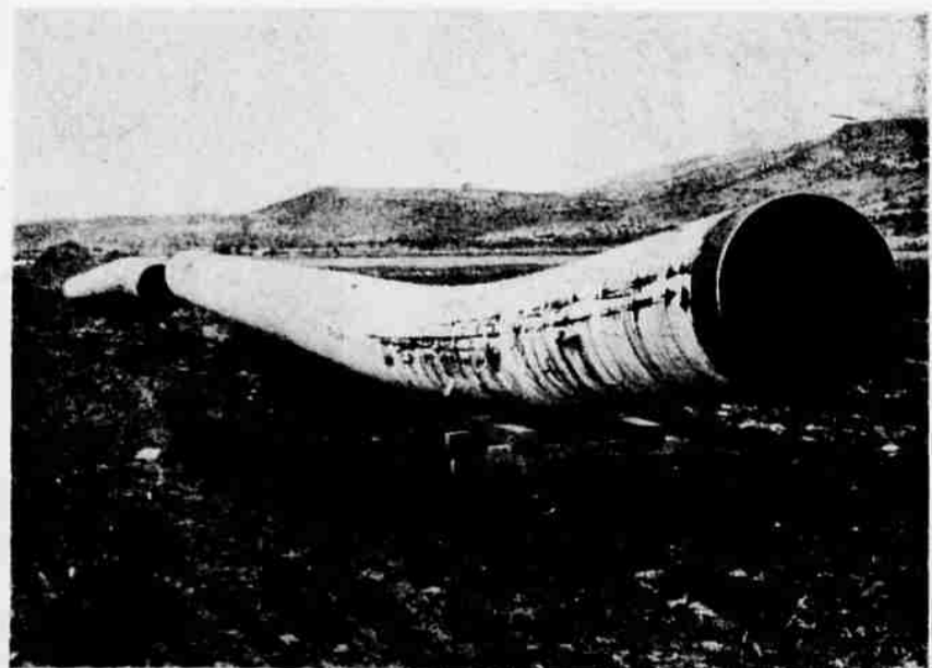
EIGHTY-FOOT PIPE SECTIONS are placed on wooden platforms along the pipeline right-of-way before being placed in the ditch. The sections are "double ended" — two 40-foot sections welded together—at a storage yard at Sprague River by the Stanley-Bledsoe Corp. of Tulsa, Okla. More than 72 miles of pipe were processed at Sprague River.