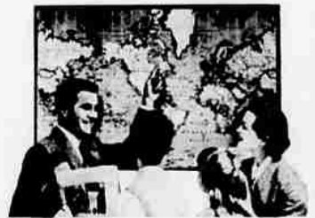
This Giant 50" x 33" 8-Color Map of The World... Yours FREE with additional information about OUR WONDERFUL WORLD

Our Wonderful World is fully encyclopedic in its wide scope of subjects but it's excitingly different in presentation. The subjects are presented in a natural, continual flow— like a story —instead of a mere alphabetical sequence of abbreviated, unrelated items. This fascinating arrangement stimulates the reader . . . takes him deeper and deeper into the world of knowledge . . . opening doors of interest that can set the pattern for future achievements.