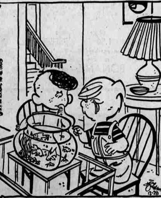
THEY'LL LET YA PET 'EM.....IF YOU'RE QUICK ENOUGH!