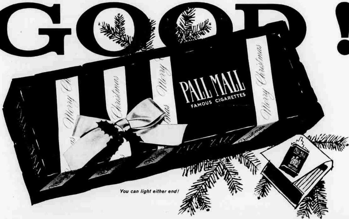
You can light either end!

Taste PALL MALL...so GOOD ! GOOD ! GOOD !