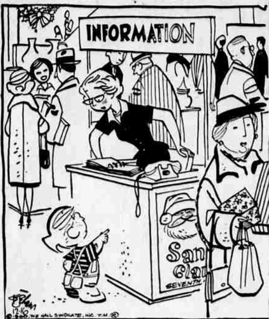
"IF A MOTHER REPORTS A LOST LITTLE BOY, I'LL BE UP IN THE TOY DEPARTMENT."