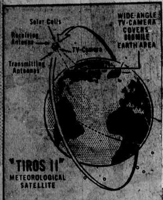
CHARTS of America's new Tيروس weather satellite with two TV cameras are shown on this map. The 280-pound satellite was launched in the nose of a Thor-Delta rocket as the U.S. achieved its 14th space success this year.