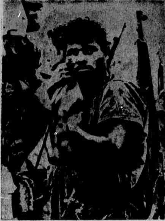
A REBEL PRISONER still carries his rifle after capture by government troops on the Costa Rican-Nicaraguan frontier. The rebel forces were caught in a squeeze between Nicaraguan and Costa Rican government troops as they were withdrawing from Nicaragua after an abortive invasion of that country.