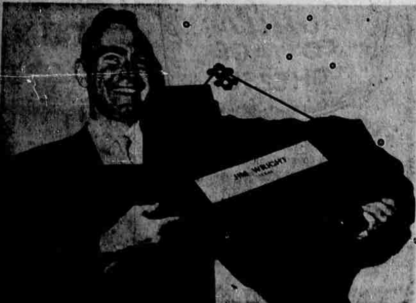
REP. JIM WRIGHT (Dem.) of Texas holds a wooden cutout of Texas covered with cattle brands in Washington, D.C., after announcing he will run for the Senate seat of Vice President-elect Lyndon B. Johnson. A special election will be held early next year to fill the vacancy.