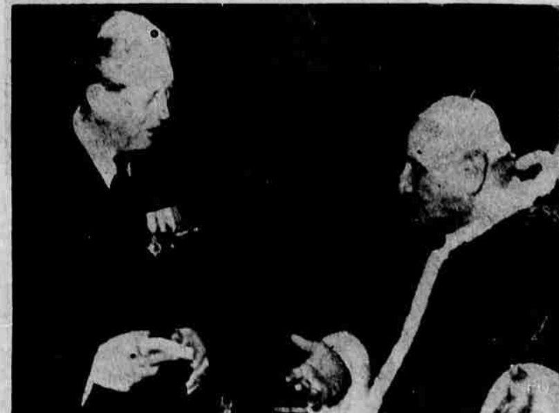
VISITING with Pope John XXIII is British Prime Minister Harold Macmillan. The Pope called Macmillan a statesman "inspired by the great ideals of freedom, justice and peace."