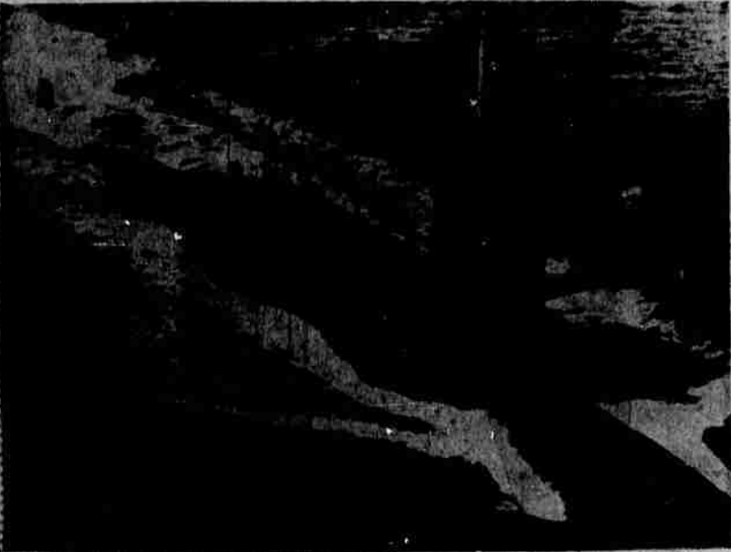
OPERATIONAL and ready for action is the nuclear submarine George Washington shown here leaving Charleston, S. C., en route to sea for first submerged patrol duty, and armed with 16 nuclear-tipped ballistic missiles. The missiles, which have a range of more than 1,200 miles, can be fired from beneath the surface of the ocean. Once beneath the waves, the sub was not scheduled to surface again until she puts into her home port at New London, Conn., in mid-January for maintenance.