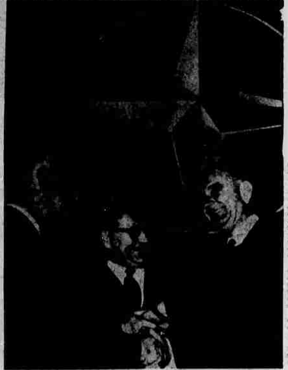
JOHNSON ADDRESSES NATO meeting during his trip abroad. Here, the vice president-elect, Lyndon Johnson, right, is greeted by Norway's Nils Langhelle, left, chairman of the NATO parliamentarians, and Halvard Lange prior to addressing the meeting. Johnson assured the Atlantic Alliance that the new U.S. "leadership" would use all resources for a free and peaceful world.