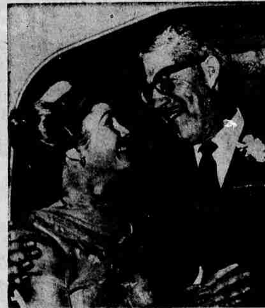
WED just three hours after announcing their engagement were actress Debbie Reynolds and shoe magnate Harry Karl, who smile happily at each other. They left for an undisclosed location for their honeymoon.