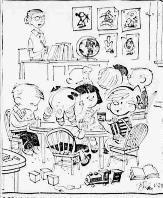
I BRING IT FROM HOME. IT'S CALLED CHOCOLATE POWDER YA JUST PUT A LITTLE IN YOUR MILK, STIR, AN YA GOT A REAL DRINK!