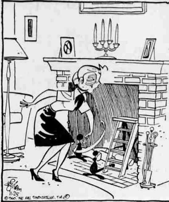
"DID YOU HEAR ME? AT ONCE!...."

Two Indian army officers were reported beaten and two others seized by Congolese troops in Leopoldville last Tuesday. Nehru said he was making inquiries and had asked U.N. Secretary-General Dag Hammarskjold what the U.N. proposes to do about the situation.