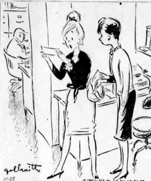
"No, there's nothing wrong with this month's pay check. I'm just trying to remember what I spent it for!"

SEARS 133 S. 6th Open 9:30 - 5:30, Friday Till 9