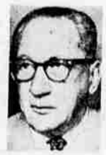
THE DOCTOR SAYS . . .

Thou art never at any time nearer to God than when under tribulation; which He permits for the purification and beautifying of thy soul. — Miguel Molinos.