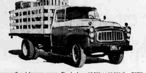
Order new D-301 diesel engine is available in compact-design (left) or conventional INTERNATIONAL Trucks from 16,000 to 19,000 lbs. GVW.