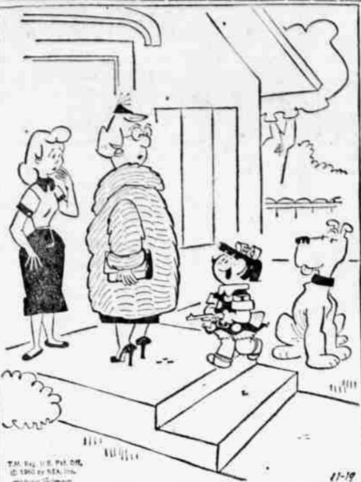
"Can Shultz have a sniff off your fur? We're going rabbit hunting!"