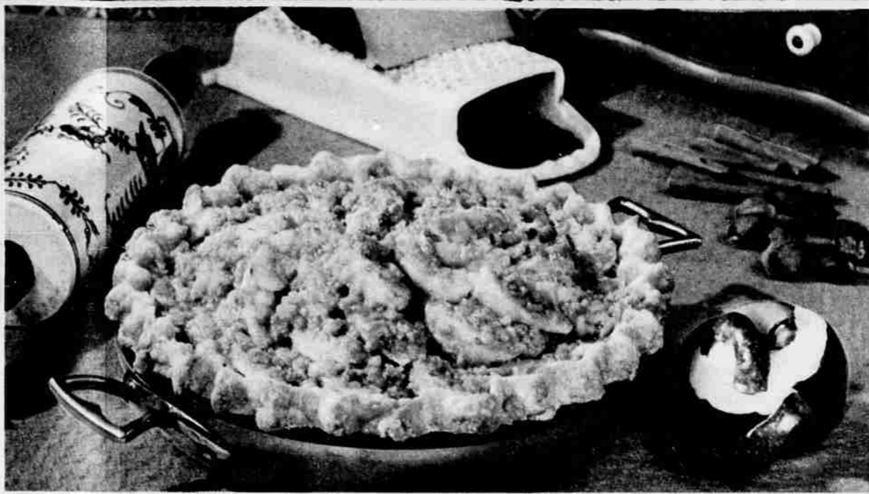
This apple pie, with its attractive golden crunchy topping, combines the best of many old-time recipes.

■ Nostalgic as the butter churn—authentic as an old spinning wheel—are these treasured, generation-to-generation recipes