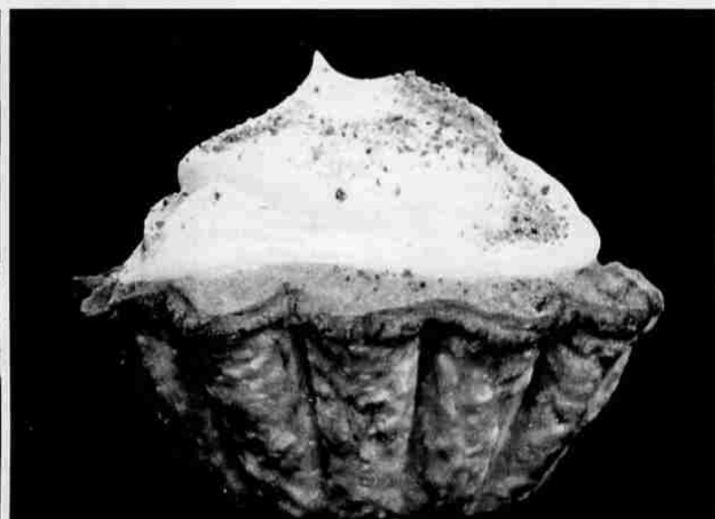
Festive Pumpkin Tarts. Fill tarts with fabulous pumpkin filling below —cover with gobs of Dream Whip. Dream Whip goes anywhere .