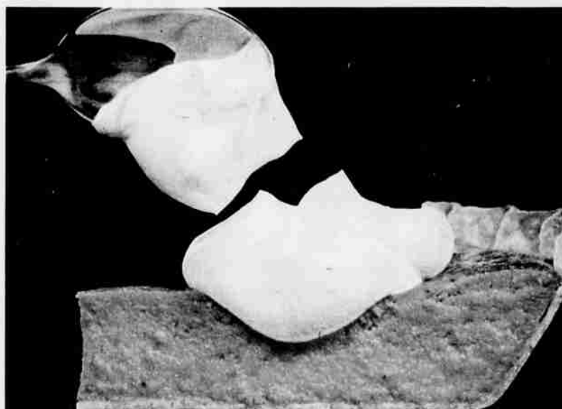
So elegant, so easy. Whether it's pumpkin pie from the store, bakery or your oven, dress it up with light, lovely Dream Whip.