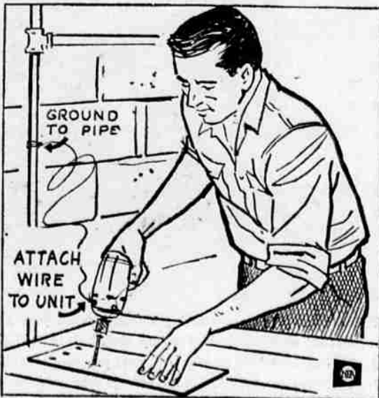
Power tool properly grounded is the best health insurance you can have in the workshop. If unit is not equipped, run ground wire from convenient screw or bolt to heating or plumbing pipe.

Keep the entire area safe by storing inflammable items in stoppered cans, and preferably out of the house. Keep the basement stairs free of debris, overshoes and packages.