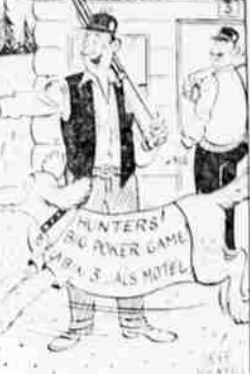
"Okay! Now go score up the game!"