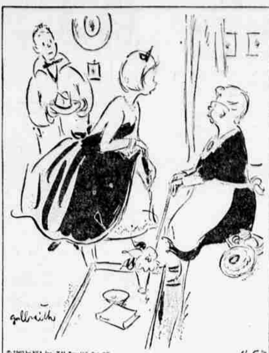
"But, Gram, I'm not the least bit cold! There's a great deal of warmth in starch!"