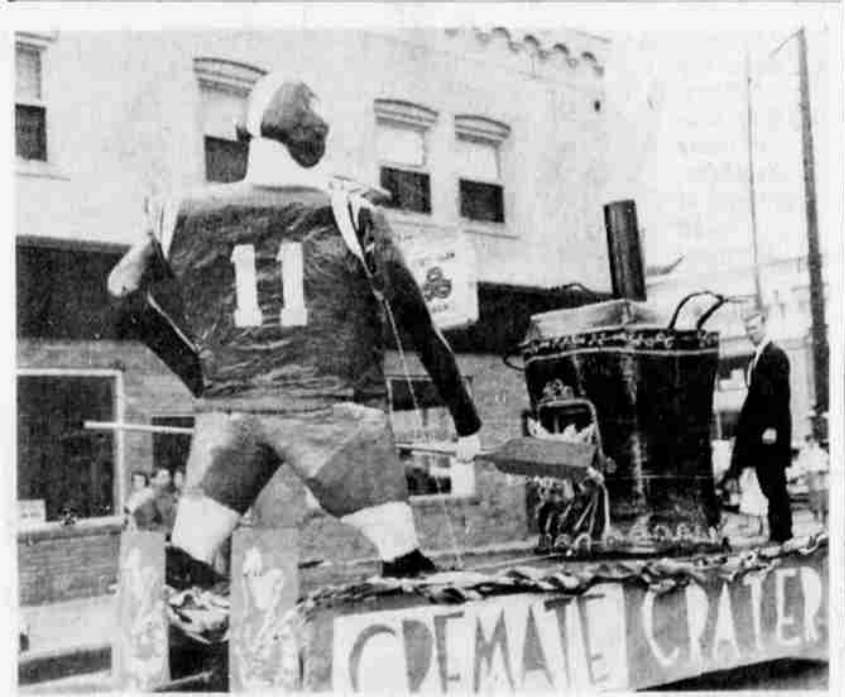
ONE OF THE BEST floats in the KUHS Homecoming Parade Friday afternoon was this one, depicting a Klamath football player shoveling Crater High into a black furnace, complete with smoke, and two morticians disposing of the remains on the other side. The float was one of a number of well-constructed floats that graced the homecoming parade. The Pelicans topped off their homecoming festivities Friday night with a 27-6 victory over Central Point's Comets.

MILWAUKEE, Wis. (AP)—A riot in which police sought to control a crowd of 800 persons broke out early Saturday morning after a rock 'n' roll stage show at a neighborhood theater.