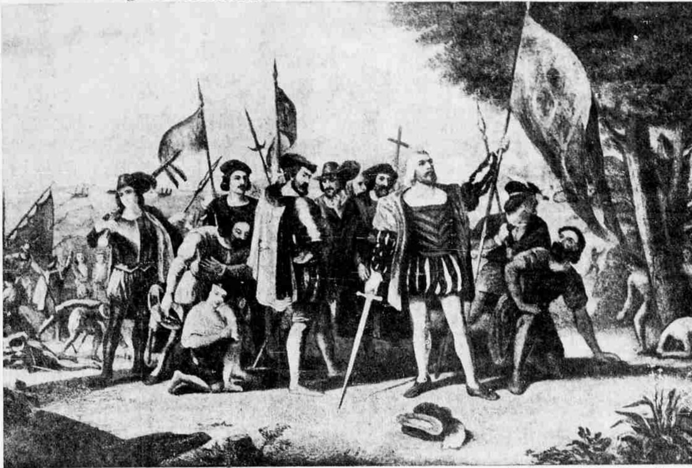
Probably the most famous painting of Columbus is that of the American artist John Vanderlyn. It shows the great Italian seafarer claiming his discovery he achieved most of his success in Europe. In 1842, Congress commissioned (generally agreed to be the Caribbean island of San Salvador) in the name him to execute "The Landing of Columbus" for one of the panels in the of Ferdinand and Isabella of Spain. Vanderlyn, born in the first year of the Capitol in Washington.