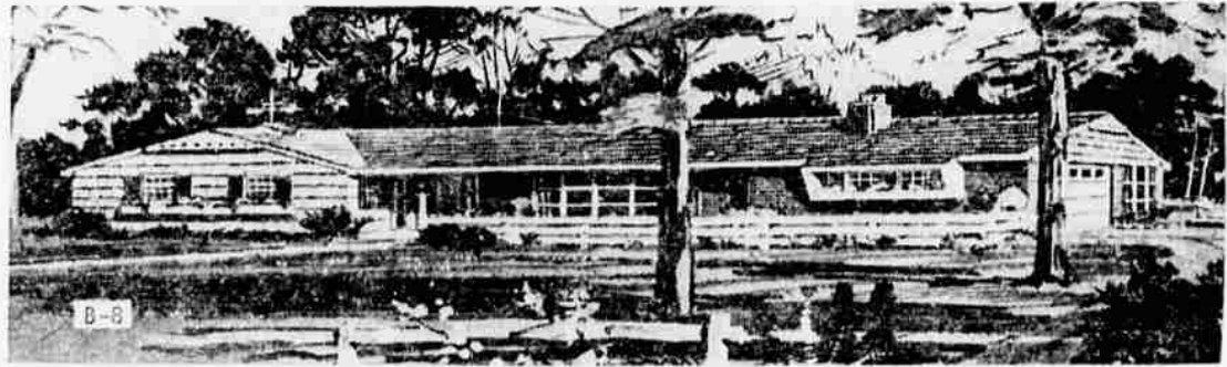
DESIGNED FOR THE DISCRIMINATING: Emphasis in this moderate-sized three-bedroom ranch was placed on luxury. Living space is lavished on a glamorous sunken

Just as the 8 by 12 foyer adds visual length to one end of the living room, the dining room opens up the other end. The atmosphere of elegance continues through the dining room because