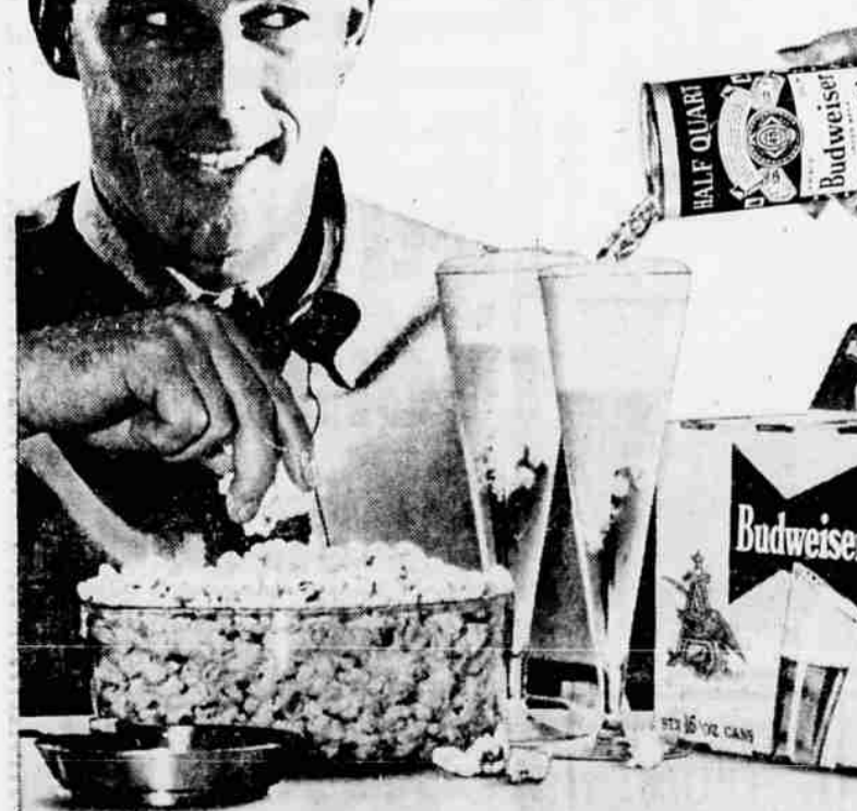
Where there's Life... there's Bud. BREWERS • ANHEUSER-BUSCH, INC. • ST. LOUIS • NEWARK • LOS ANGELES • MIAMI • TAMPA

BIG SIZE. Next time you buy Bud, try a 6-Pak of Half Quarts. Each one pours two glasses of Budweiser.